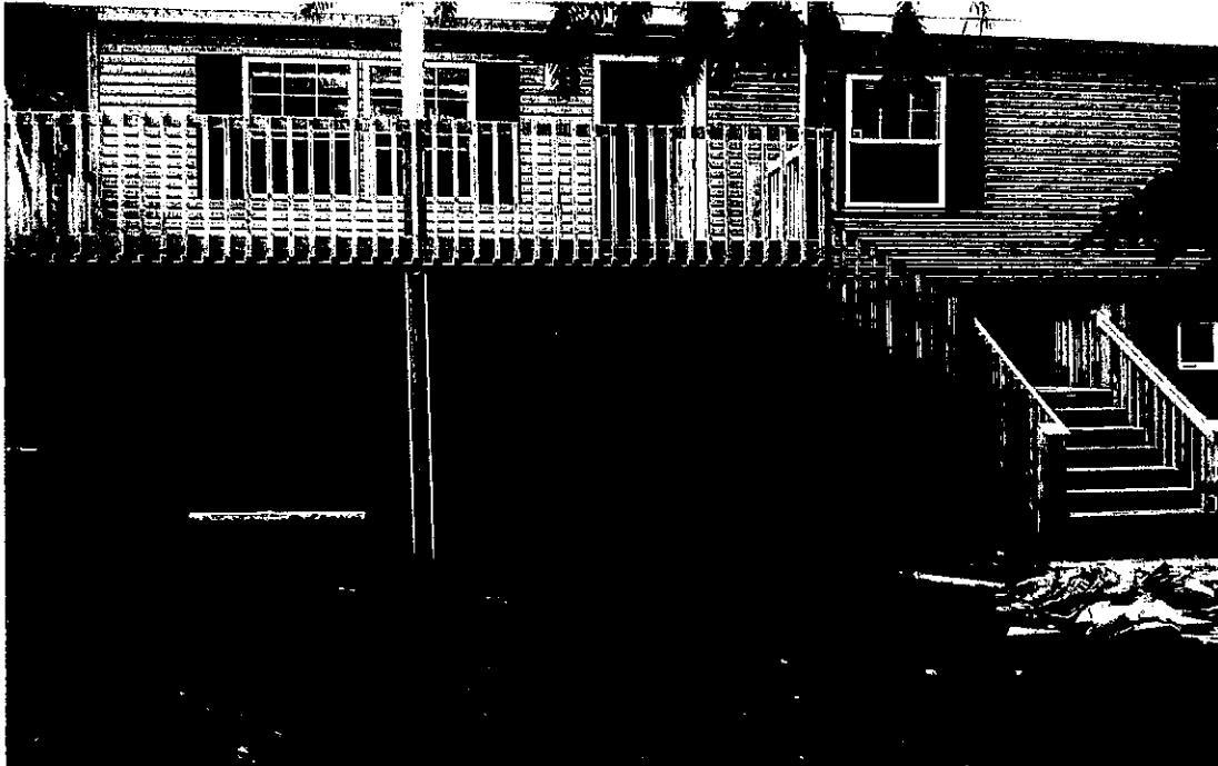
REAR VIEW 6/12/12