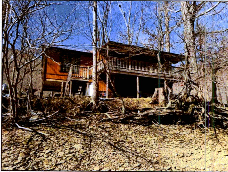
Front View Photo One

If using the Elevation Certificate to obtain NFIP flood insurance, affix at least 2 building photographs below according to the instructions for Item A6. Identify all photographs with date taken; "Front View" and "Rear View"; and, if required, "Right Side View" and "Left Side View." When applicable, photographs must show the foundation with representative examples of the flood openings or vents, as indicated in Section A8. If submitting more photographs than will fit on this page, use the Continuation Page.