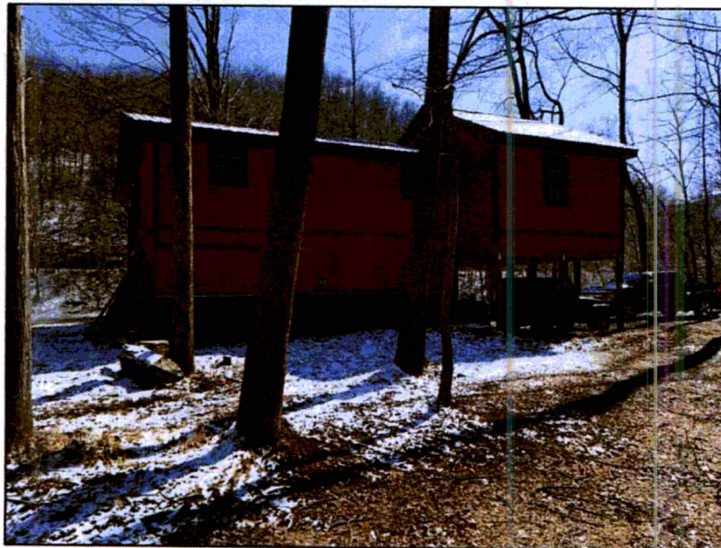
Rear View Photo Two