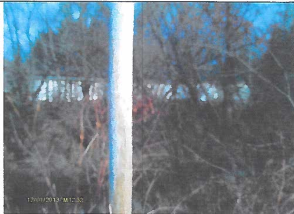
REAR VIEW (from across the Buckhannon River)

If submitting more photographs than will fit on the preceding page, affix the additional photographs below. Identify all photographs with: date taken; "Front View" and "Rear View"; and, if required, "Right Side View" and "Left Side View." When applicable, photographs must show the foundation with representative examples of the flood openings or vents, as indicated in Section A8.