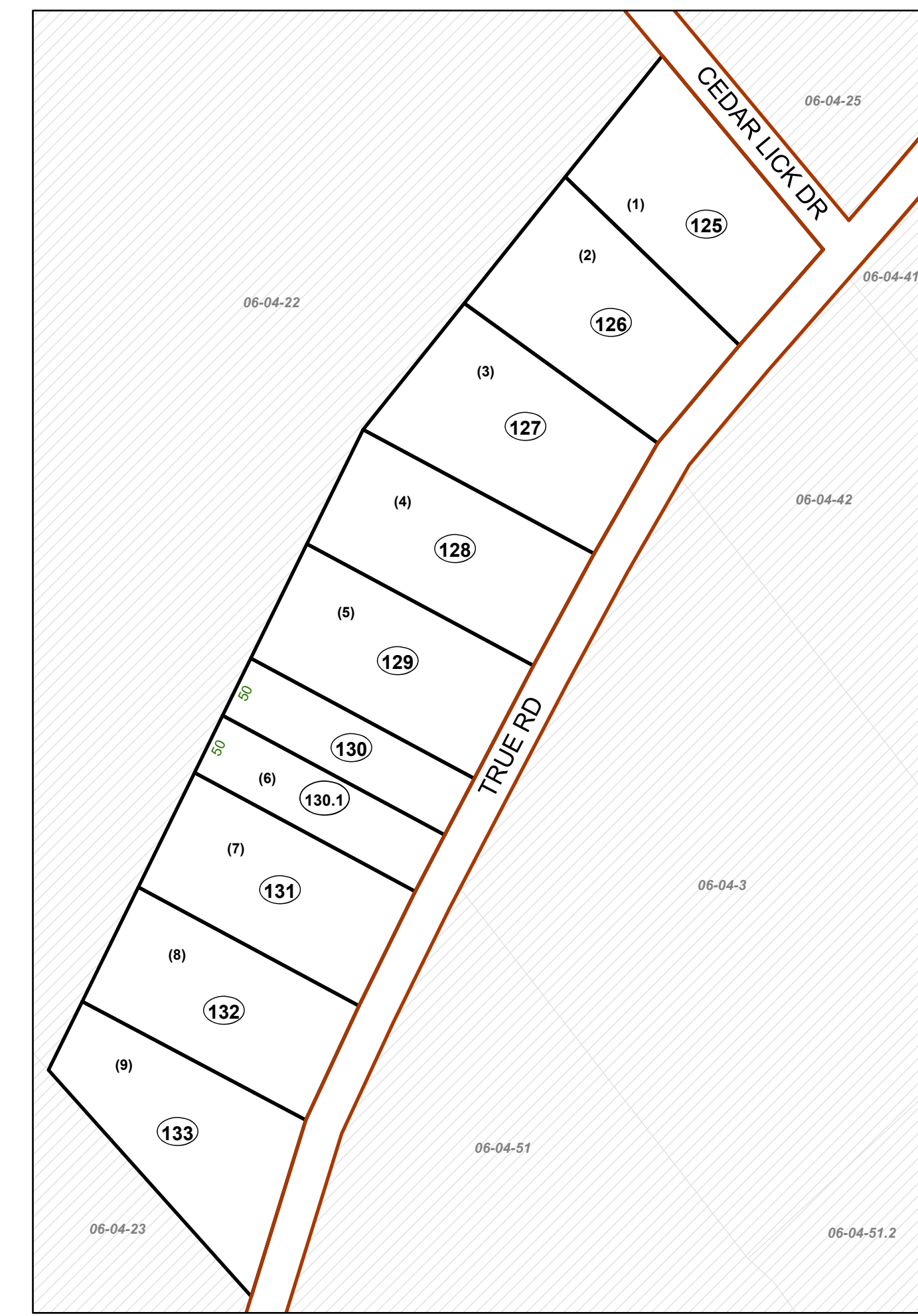
INSET A SCALE 1" = 100'