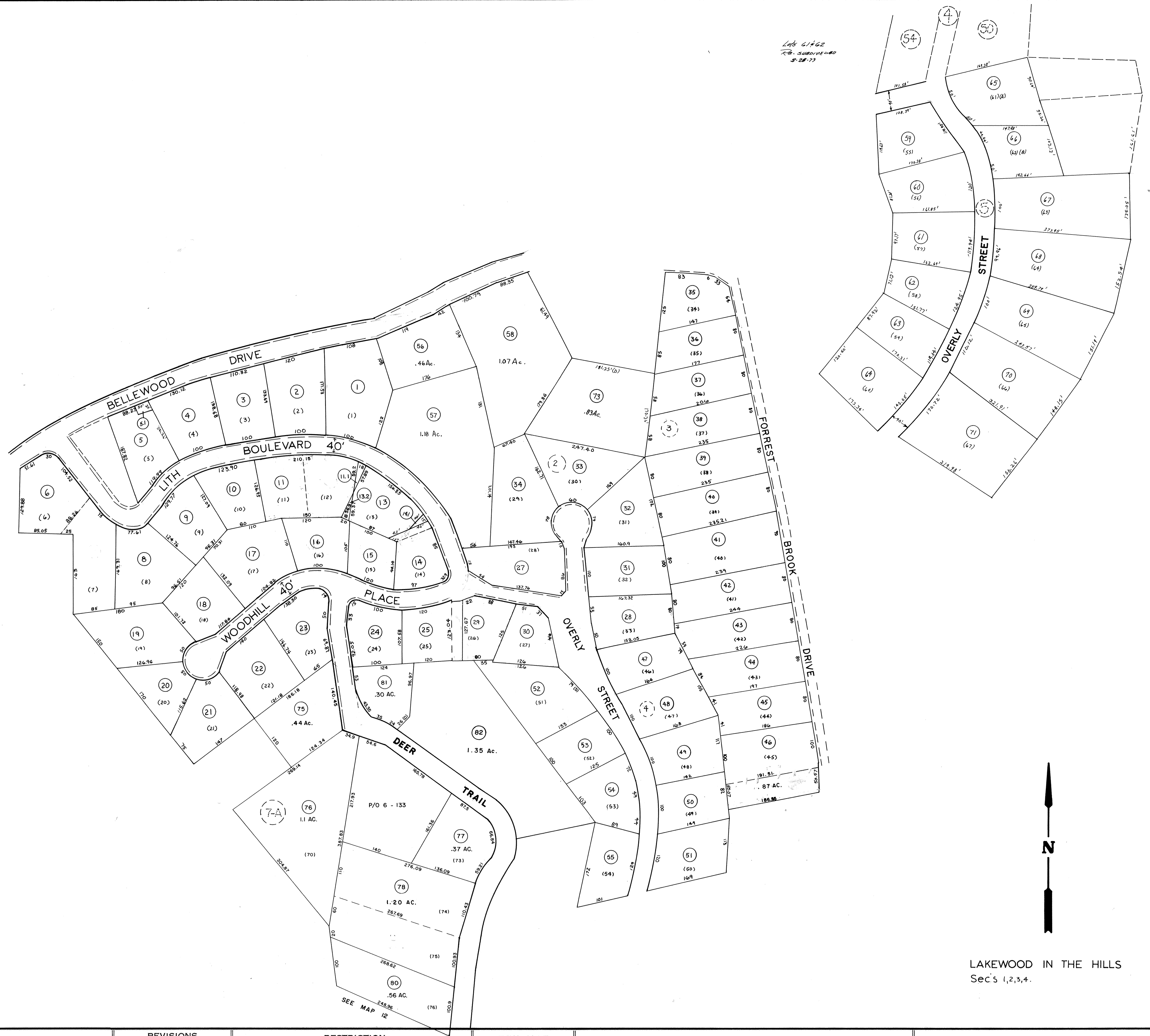
LAKWOOD IN THE HILLS Sec's 1,2,3,4.

For Tax Purposes Only Prepared by LOCAL GOVERNMENT RELATIONS DIV. STATE TAX COMMISSIONER CHARLESTON, W.VA.