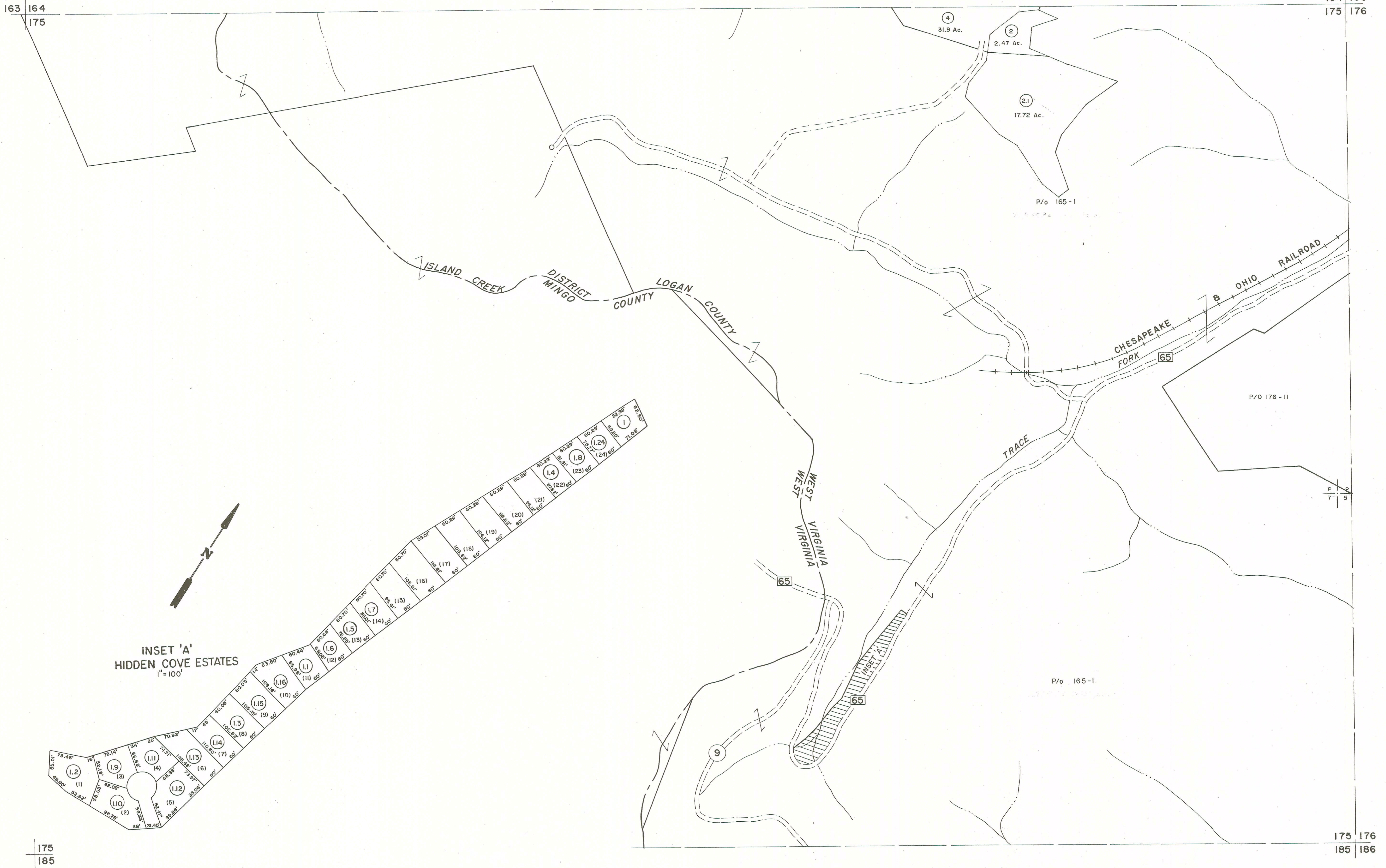
INSET 'A' HIDDEN COVE ESTATES 1" = 100'