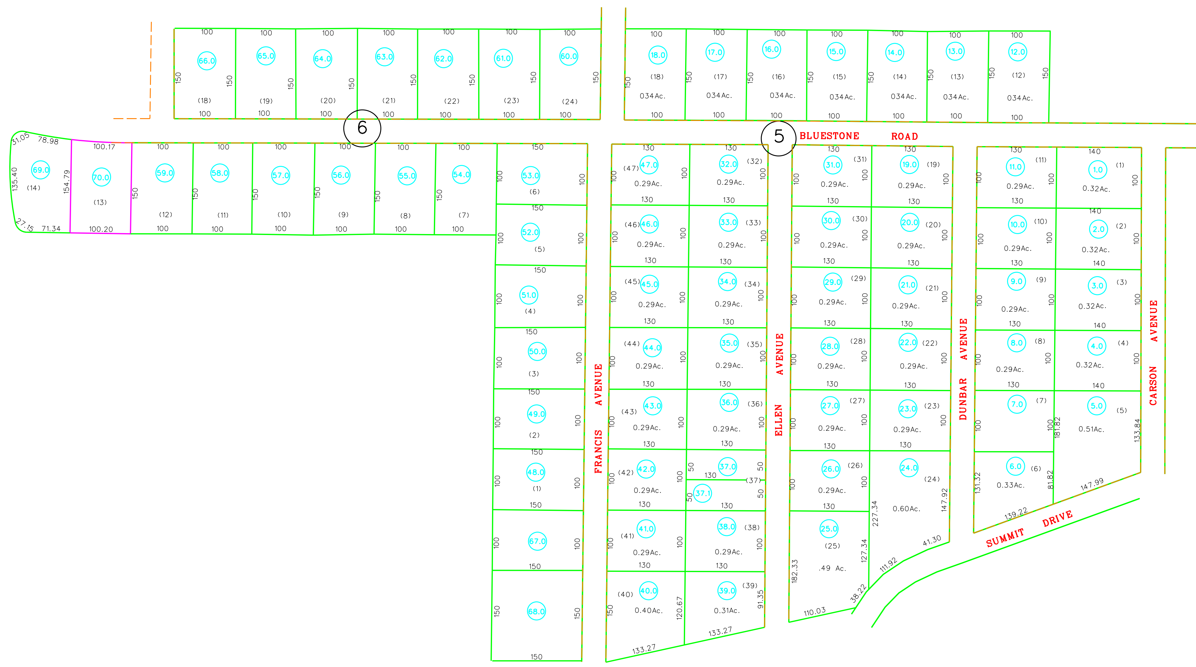
MORGAN HILLS SUBDIVISION NO. 1 SECTION 5