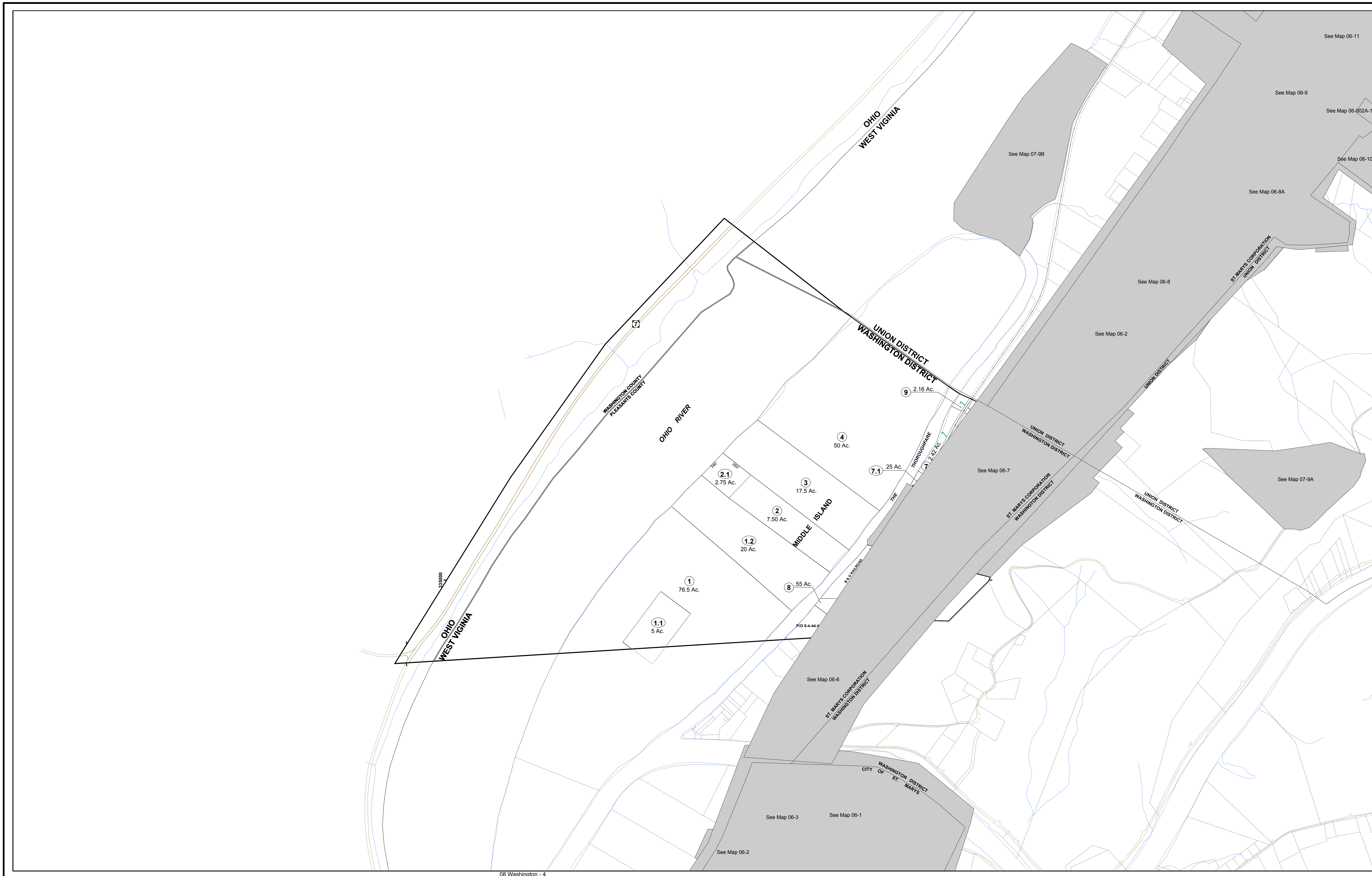
08 Washington - 4