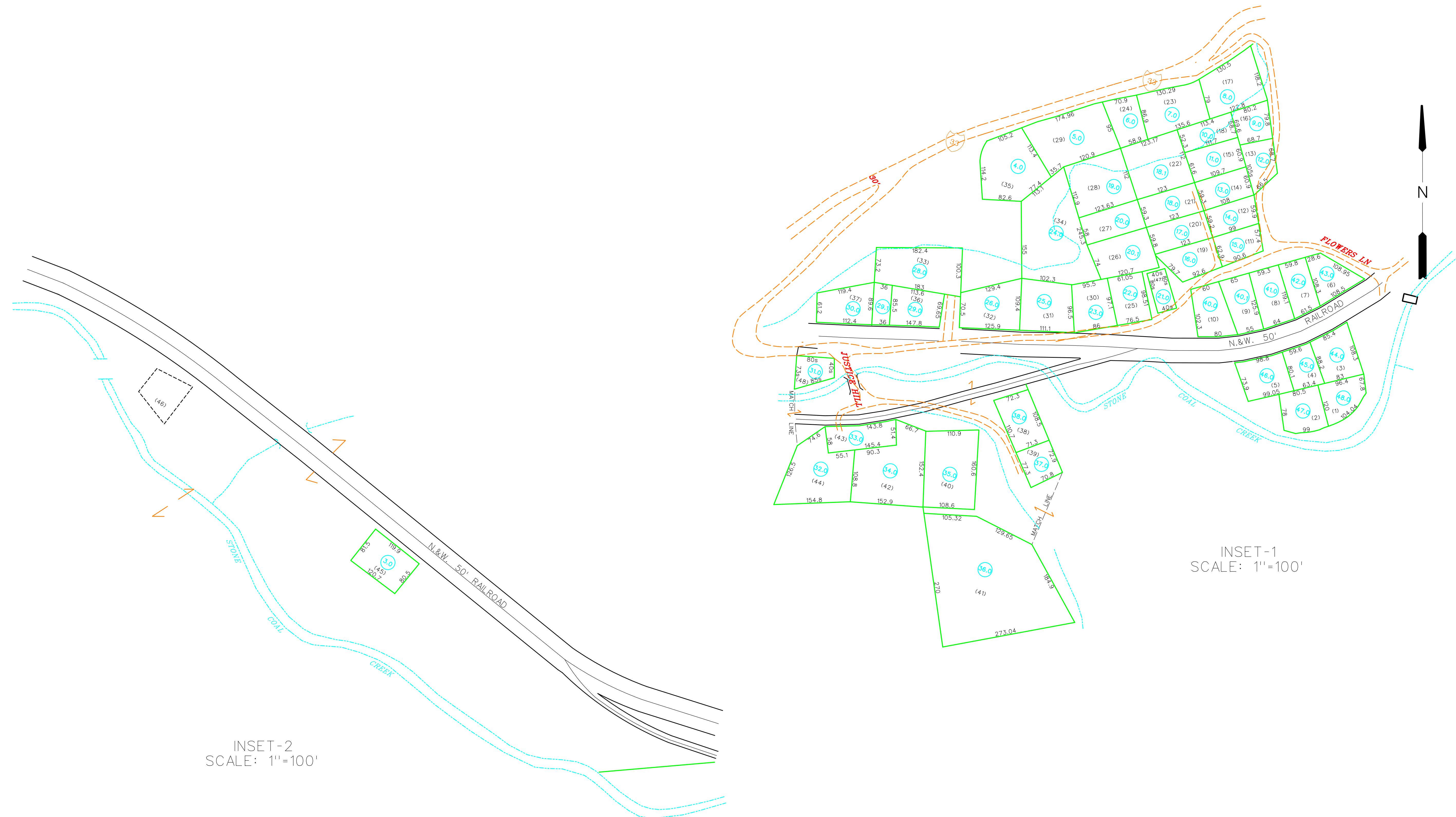
INSET-2 SCALE: 1"=100'