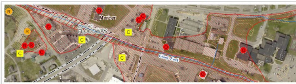
Building Level (WV Flood Tool Map)