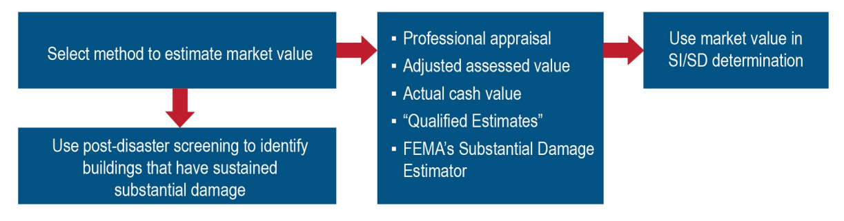
Figure 3. Determining the market value (from FEMA P-758, Figure 4-3)