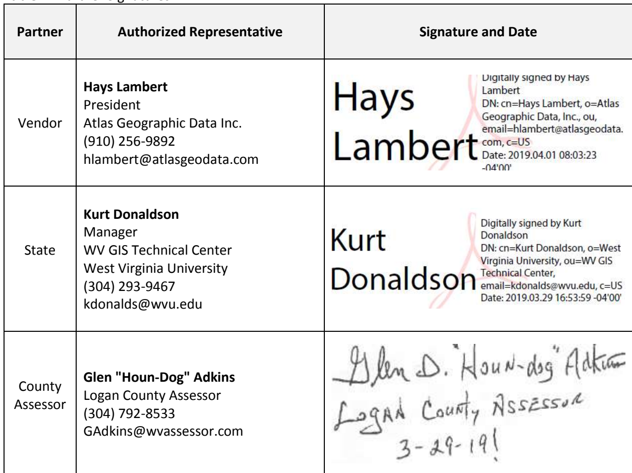
Table 4. Partner Signatures