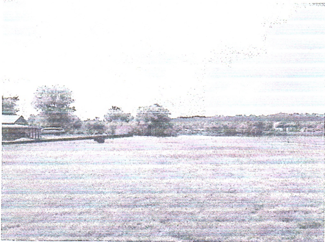
HOUSE LOCATION TO BE IN FRONT OF THE TRAILER.