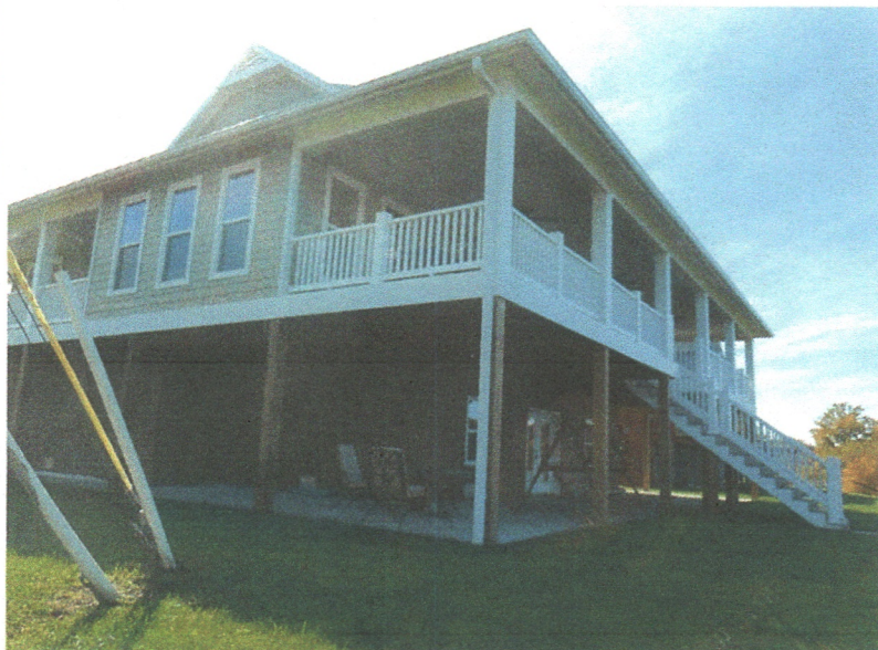
Rear and Right Side.