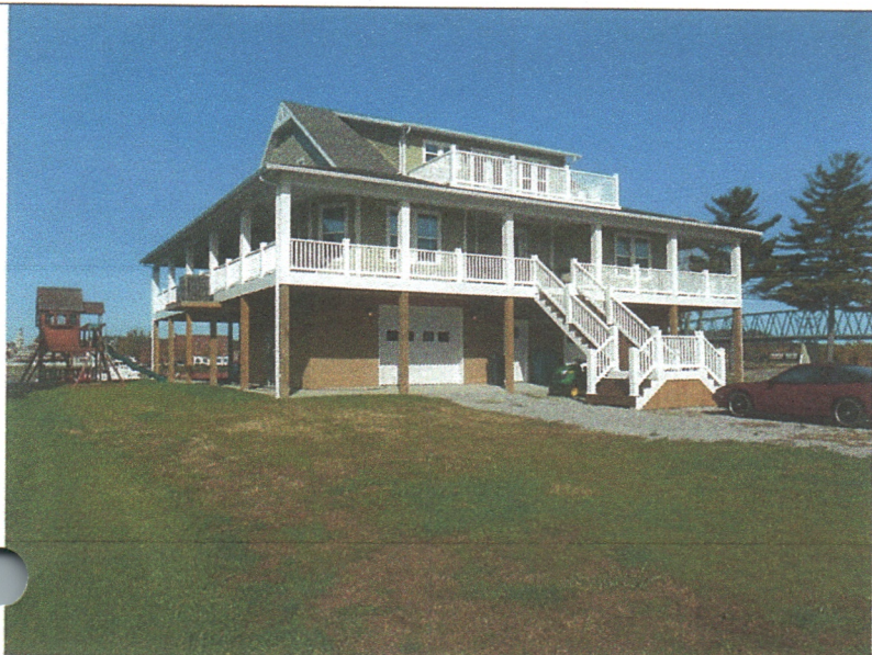
Front and Left Side.

If using the Elevation Certificate to obtain NFIP flood insurance, affix at least 2 building photographs below according to the instructions for Item A6. Identify all photographs with date taken; "Front View" and "Rear View"; and, if required, "Right Side View" and "Left Side View." When applicable, photographs must show the foundation with representative examples of the flood openings or vents, as indicated in Section A8. If submitting more photographs than will fit on this page, use the Continuation Page.