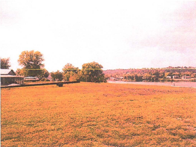
HOUSE LOCATION TO BE BEHIND TRAILER.