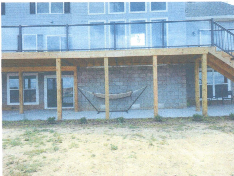
Rear view & vents