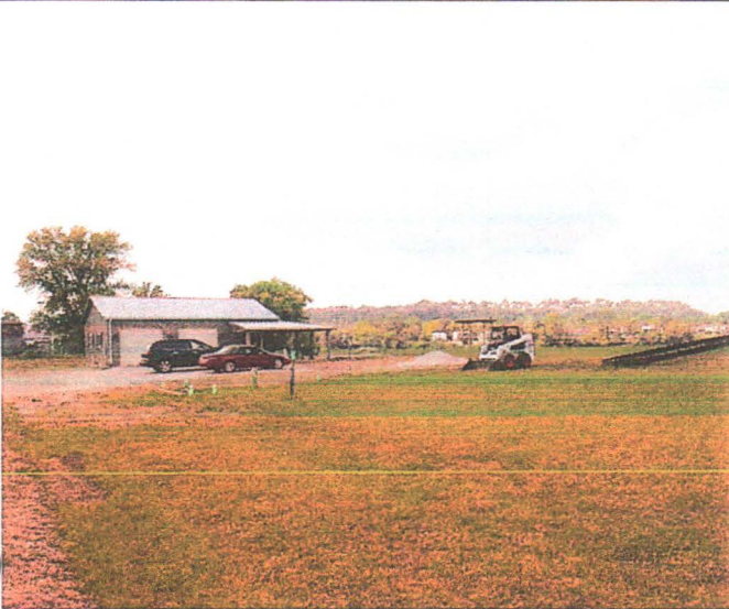
NEW HOUSE LOCATION TO BE BEHIND AND RIGHT OF THE BOBCAT.

If using the Elevation Certificate to obtain NFIP flood insurance, affix at least 2 building photographs below according to the instructions for Item A6. Identify all photographs with date taken; "Front View" and "Rear View"; and, if required, "Right Side View" and "Left Side View." When applicable, photographs must show the foundation with representative examples of the flood openings or vents, as indicated in Section A8. If submitting more photographs than will fit on this page, use the Continuation Page.