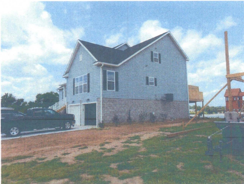
Right side view

If using the Elevation Certificate to obtain NFIP flood insurance, affix at least 2 building photographs below according to the instructions for Item A6. Identify all photographs with date taken; "Front View" and "Rear View"; and, if required, "Right Side View" and "Left Side View." When applicable, photographs must show the foundation with representative examples of the flood openings or vents, as indicated in Section A8. If submitting more photographs than will fit on this page, use the Continuation Page.