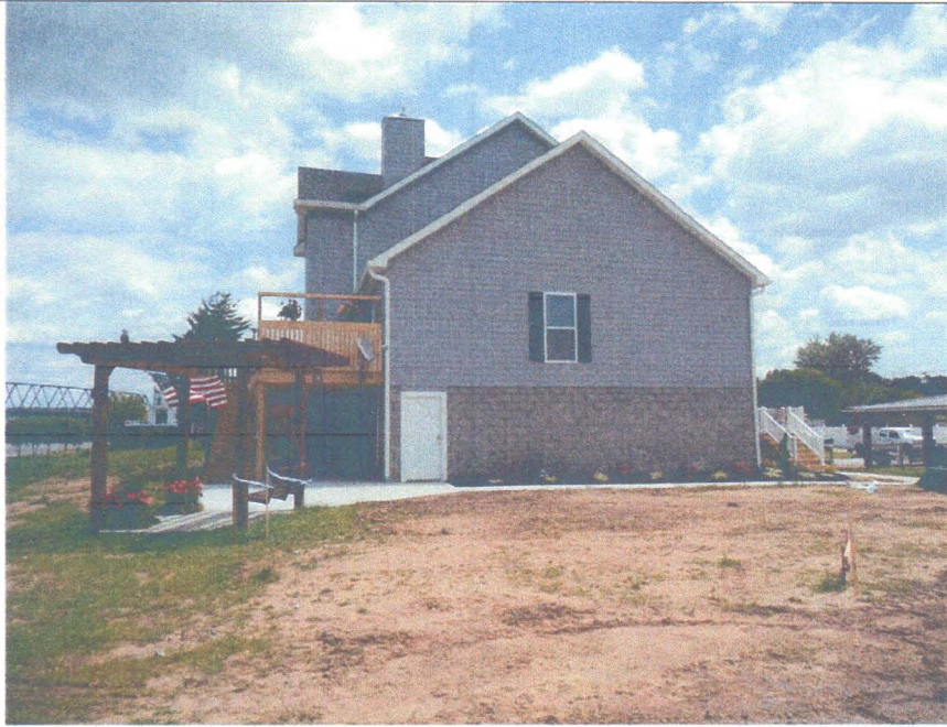
Left side view