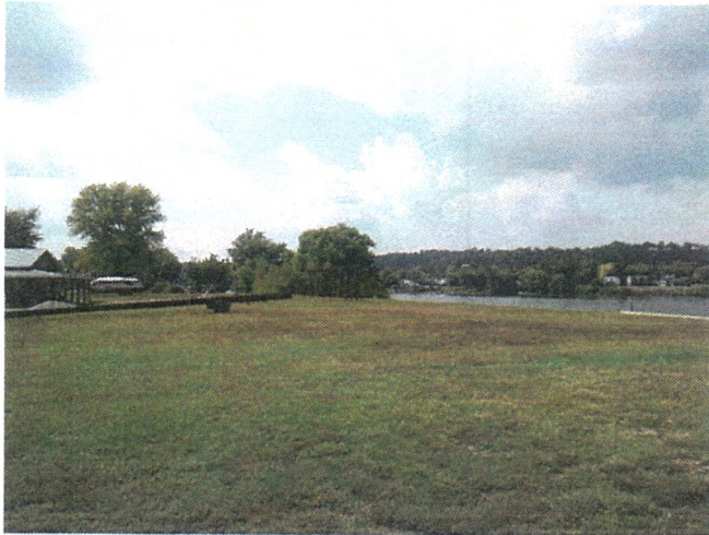
HOUSE LOCATION TO BE BEHIND TRAILER.