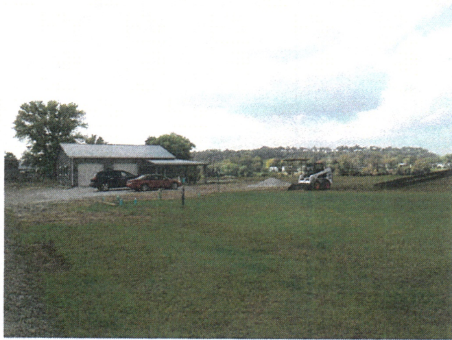
NEW HOUSE LOCATION TO BE BEHIND AND RIGHT OF GARAGE SHOWN.

If using the Elevation Certificate to obtain NFIP flood insurance, affix at least 2 building photographs below according to the instructions for Item A6. Identify all photographs with date taken; "Front View" and "Rear View"; and, if required, "Right Side View" and "Left Side View." When applicable, photographs must show the foundation with representative examples of the flood openings or vents, as indicated in Section A8. If submitting more photographs than will fit on this page, use the Continuation Page.