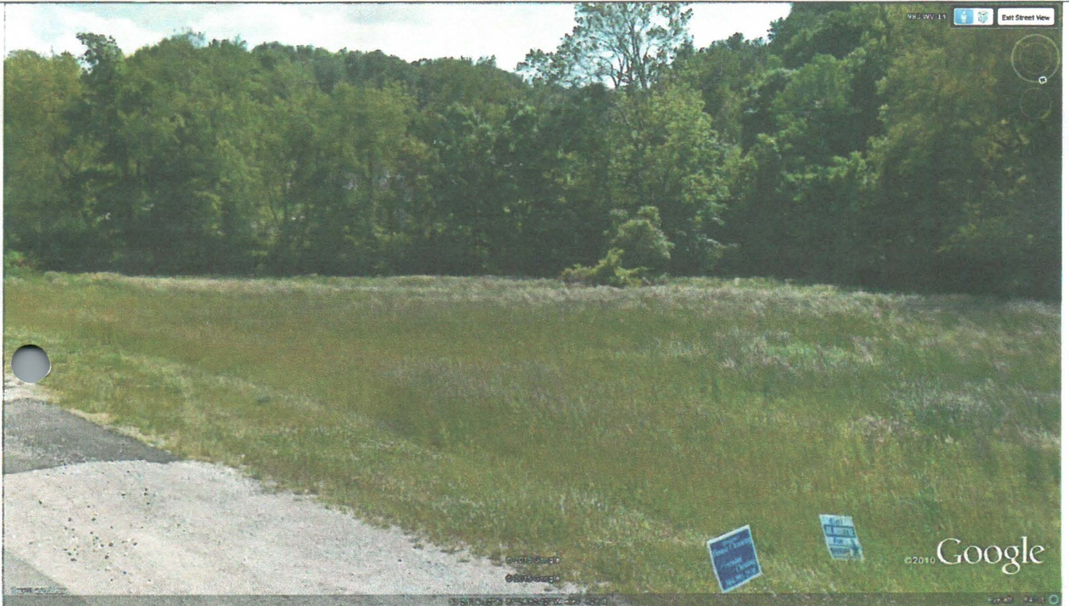
Site Photo 1

If using the Elevation Certificate to obtain NFIP flood insurance, affix at least 2 building photographs below according to the instructions for Item A6. Identify all photographs with date taken; "Front View" and "Rear View"; and, if required, "Right Side View" and "Left Side View." When applicable, photographs must show the foundation with representative examples of the flood openings or vents, as indicated in Section A8. If submitting more photographs than will fit on this page, use the Continuation Page.