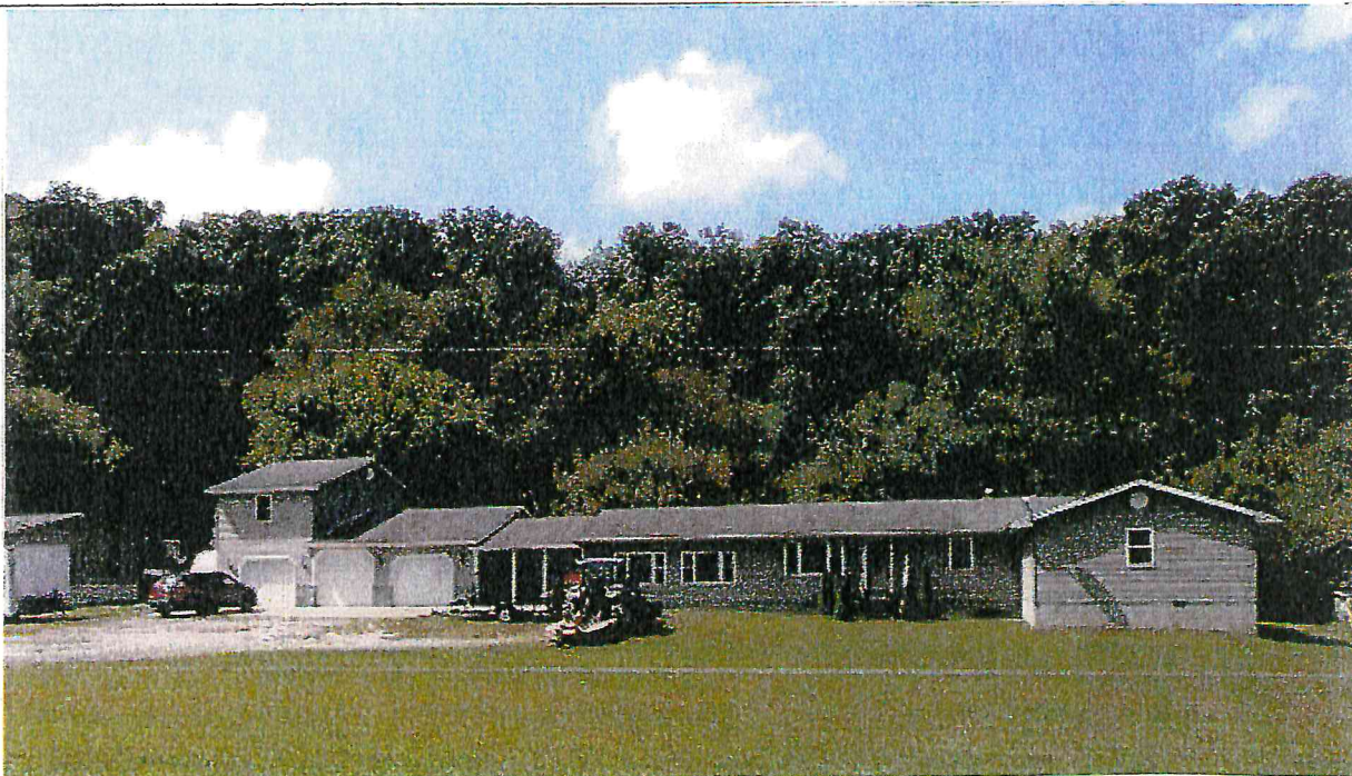
Photo One Caption Front View

If using the Elevation Certificate to obtain NFIP flood insurance, affix at least 2 building photographs below according to the instructions for Item A6. Identify all photographs with date taken; "Front View" and "Rear View"; and, if required, "Right Side View" and "Left Side View." When applicable, photographs must show the foundation with representative examples of the flood openings or vents, as indicated in Section A8. If submitting more photographs than will fit on this page, use the Continuation Page.