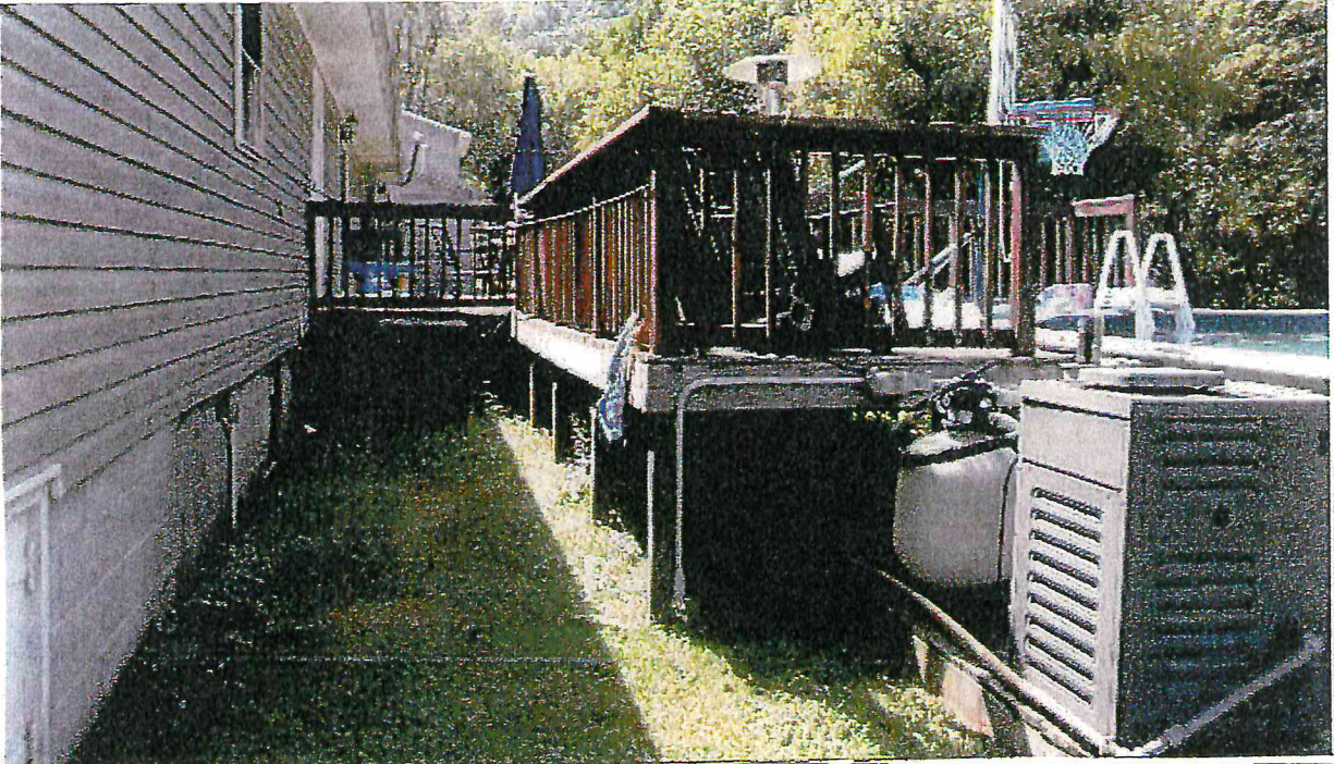
Photo Three Caption Rear View

If submitting more photographs than will fit on the preceding page, affix the additional photographs below. Identify all photographs with: date taken; "Front View" and "Rear View"; and, if required, "Right Side View" and "Left Side View." When applicable, photographs must show the foundation with representative examples of the flood openings or vents, as indicated in Section A8.