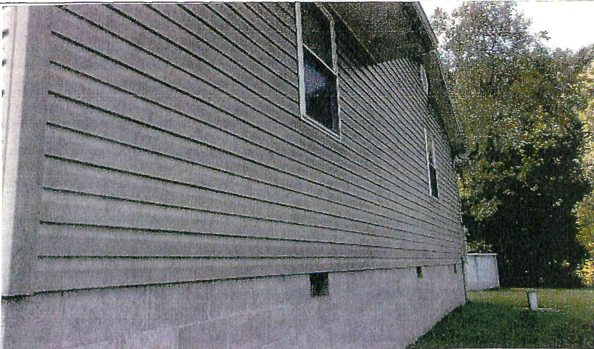
Photo Two Caption Side View