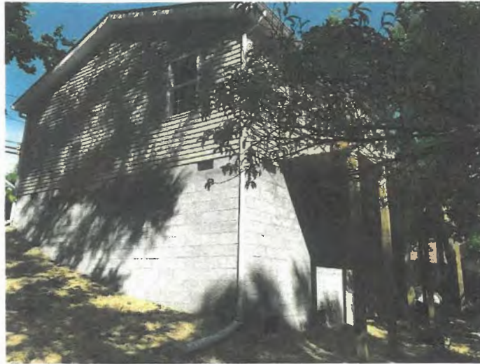
Photo Three Caption From right rear perspective

If submitting more photographs than will fit on the preceding page, affix the additional photographs below. Identify all photographs with: date taken; "Front View" and "Rear View"; and, if required, "Right Side View" and "Left Side View." When applicable, photographs must show the foundation with representative examples of the flood openings or vents, as indicated in Section A8.