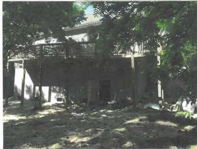
Photo Four Caption From left rear perspective