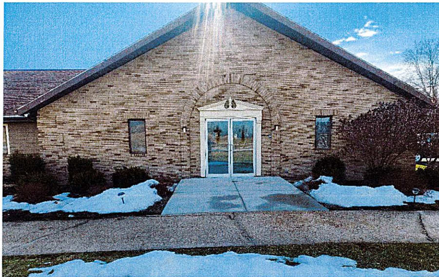
Right Front Congregation Entrance