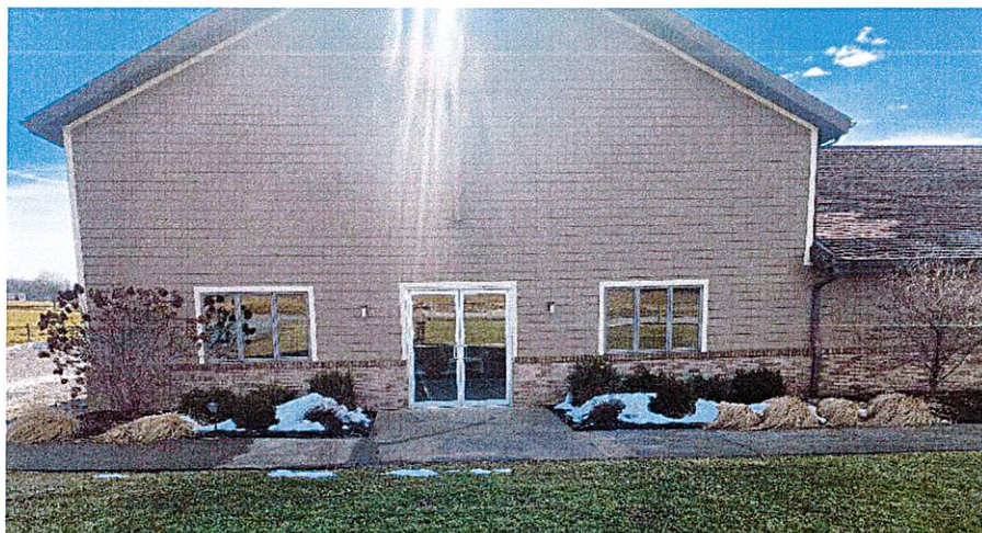
Left Front Entrance