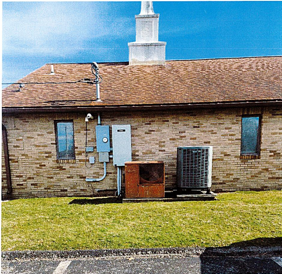
Right Side Utilities