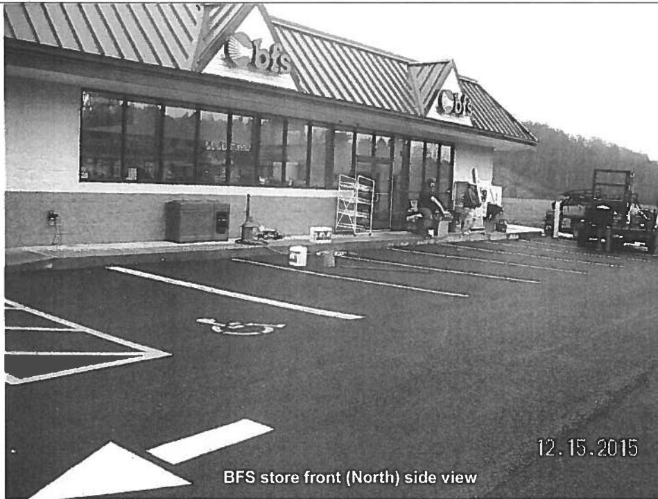
BFS store front (North) side view

If using the Elevation Certificate to obtain NFIP flood insurance, affix at least 2 building photographs below according to the instructions for Item A6. Identify all photographs with date taken; "Front View" and "Rear View"; and, if required, "Right Side View" and "Left Side View." When applicable, photographs must show the foundation with representative examples of the flood openings or vents, as indicated in Section A8. If submitting more photographs than will fit on this page, use the Continuation Page.