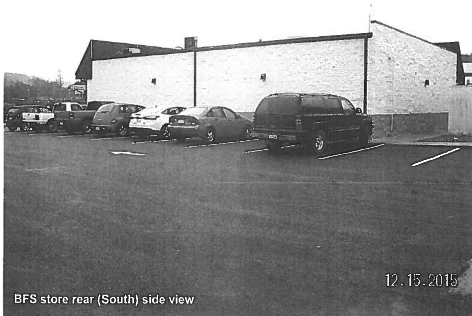
BFS store rear (South) side view