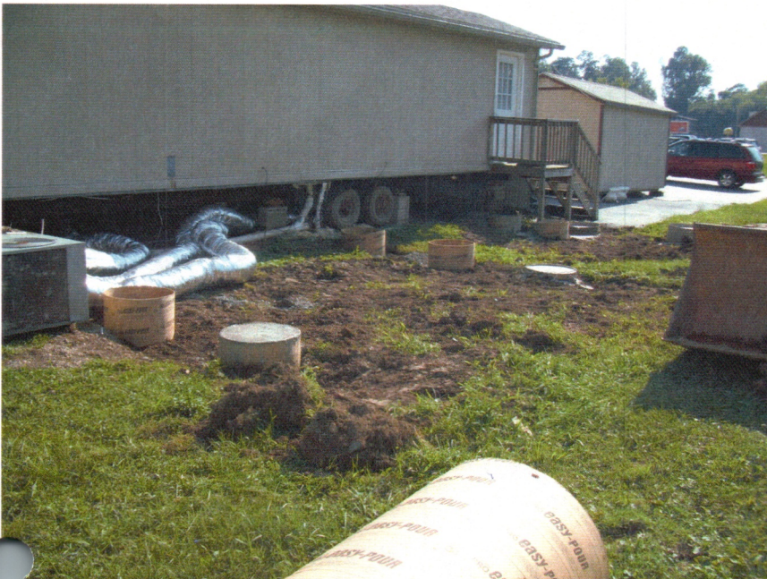
Rear View 8-19-13