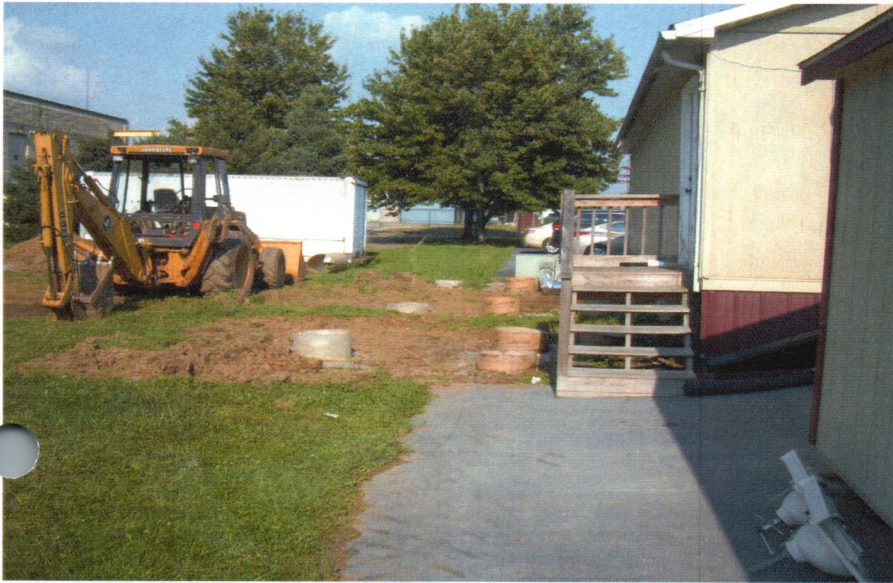
Side View 8-19-13

If using the Elevation Certificate to obtain NFIP flood insurance, affix at least 2 building photographs below according to the instructions for Item A6. Identify all photographs with date taken; "Front View" and "Rear View"; and, if required, "Right Side View" and "Left Side View." When applicable, photographs must show the foundation with representative examples of the flood openings or vents, as indicated in Section A8. If submitting more photographs than will fit on this page, use the Continuation Page.