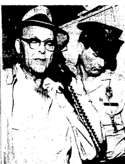
WEARY MAYOR — Charleston's Mayor Shanklin, up all night saving disaster area in city, prepared to assess the damage today with Civil Defense engineers from Washington.

"Miraculously, however, we had no injuries that I know of and no deaths," he said.