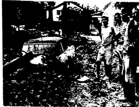
A vicious summer storm dumped tons of water down Wertz Avenue in the east end of Charleston.