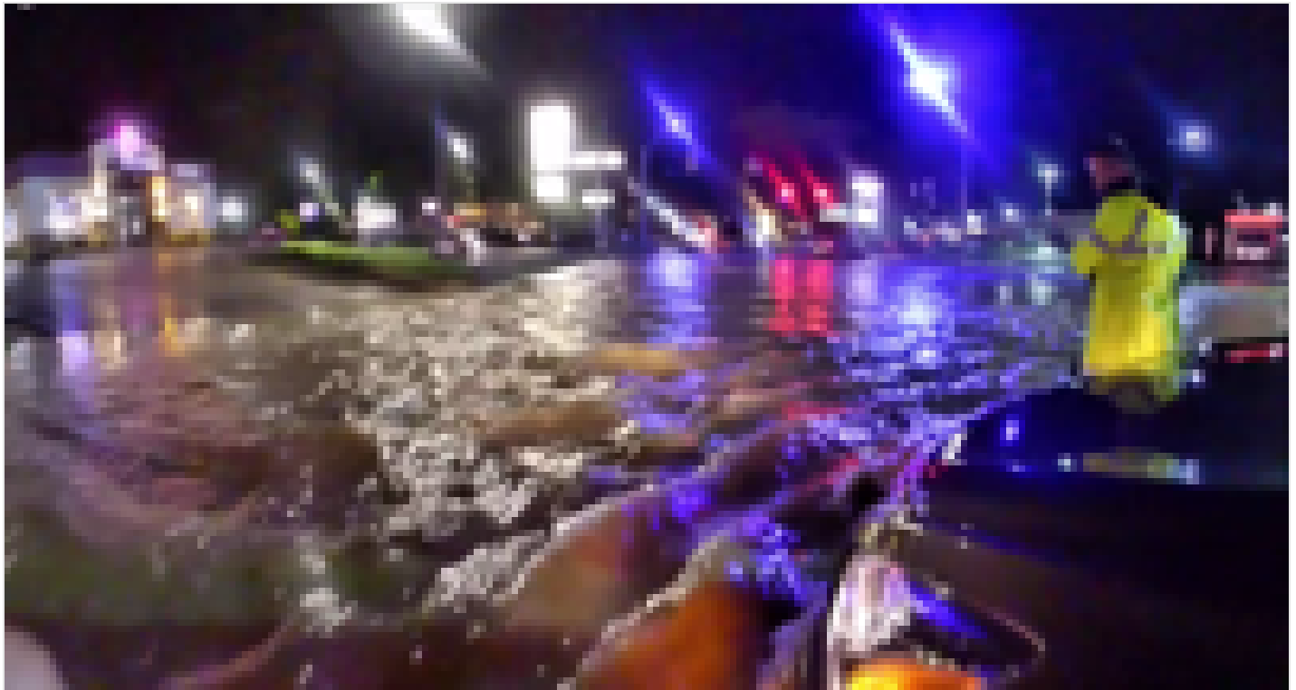
Patteson Drive flooding swamps cars, strands motorists

The city’s Public Works Department is currently cleaning up debris caused by the storms.